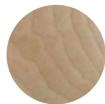
Maple North American Maple