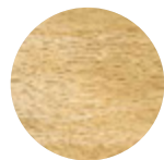
Oak American White Oak